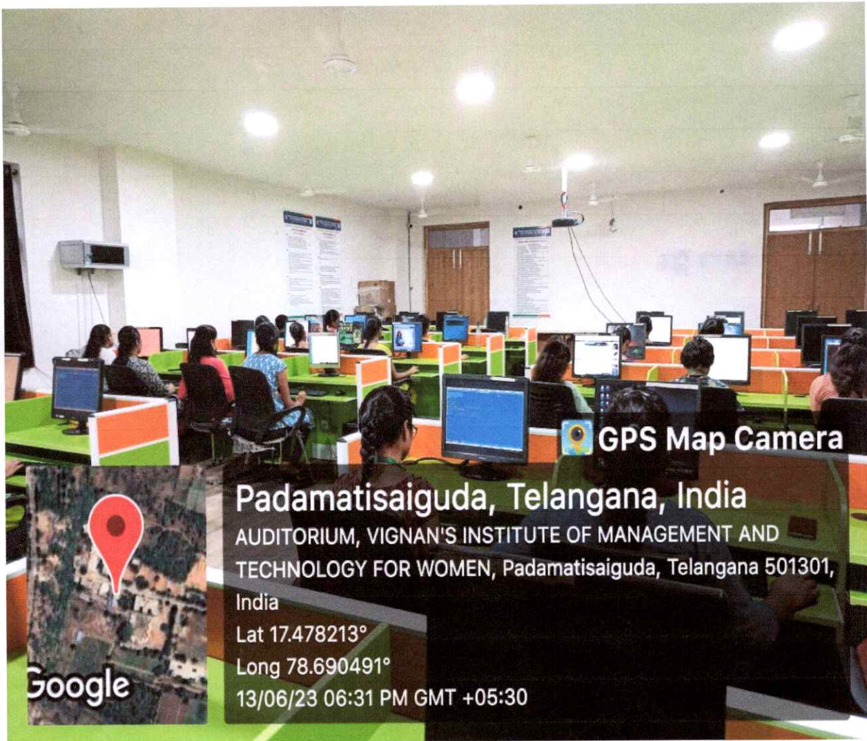
Hostler Students Utilise the Computer Lab

Additional reading & practice hours: 4:30 PM to 8:30 PM