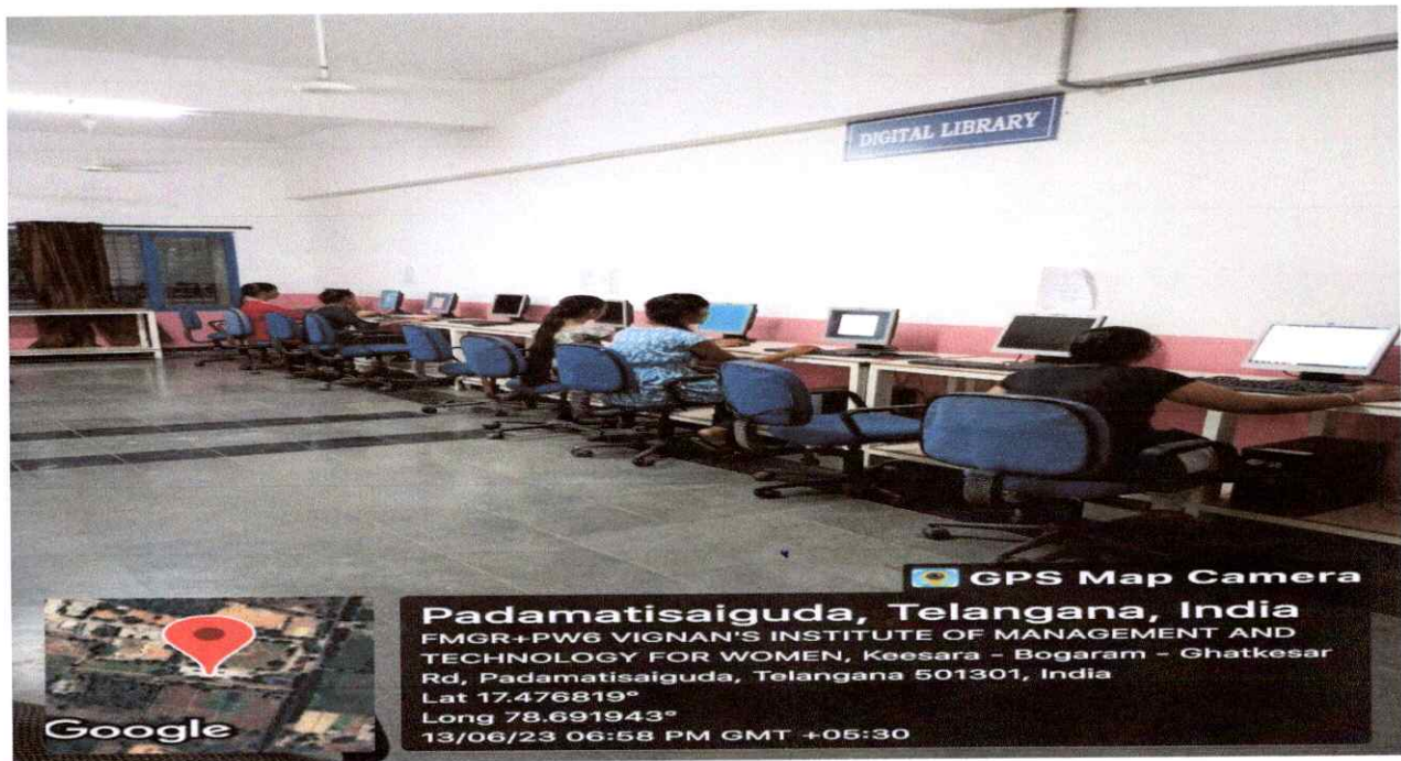
Hostler Students Utilise the College Digital Library